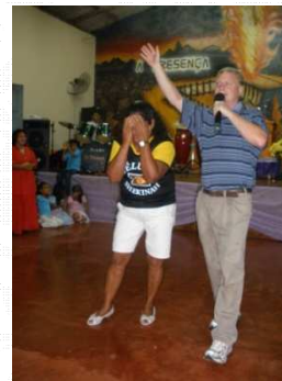
Above: Woman reacts as she receives her healing.

The fire of God's love will burn brightly in you and in those you encounter as you are activated in ministering to the sick and pray for their healing. You will be sure to encounter God in unforgettable ways as we all press in together to see His Kingdom come and His will be done.